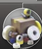
carton sealing tape