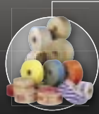
water activated tape